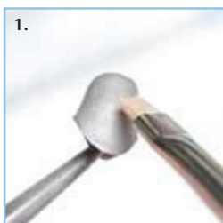
Application of Carat Biopaque Base Paste (first layer)