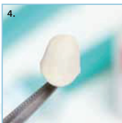
Metal frame after second firing prepared with Carat Biopaque Shade Paste and powdering crystals