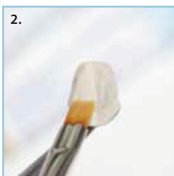
Application of Carat Biopaque Shade Paste (second layer)