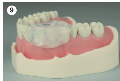
9 Correct repositioning of the filled matrix in the oral cavity