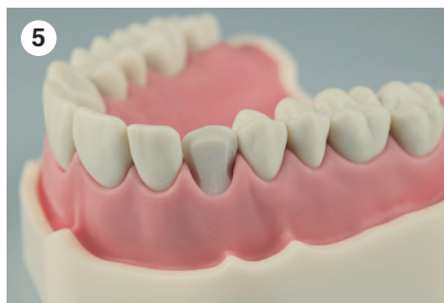
5 Preparation with bevelled enamel