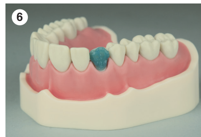
6 Etching of the prepared surface with Harvard Etch