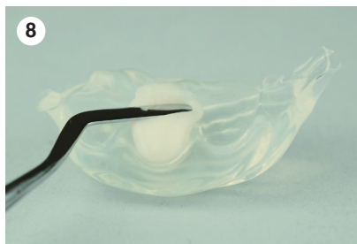
8 Application of a slightly heated packable composite in the matrix, e.g. Harvard UltraFill