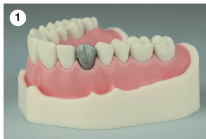
1 Initial situation