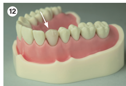
12 Finished direct composite restoration