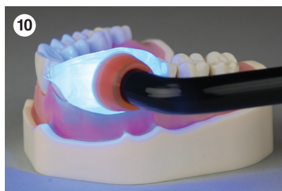
10 40 sec light curing through the matrix. Repeat the process after the removal of the matrix