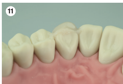
11 Excess removal and polishing with appropriate rotating instruments and if possible finishing strips