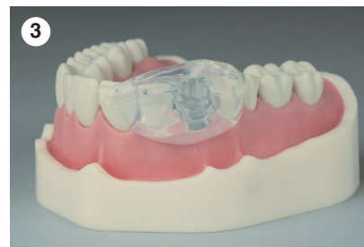
3 Fast setting time (1:20 min. intraoral)