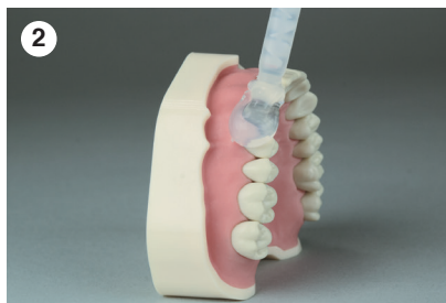
2 Harvard TransMatrix application on the prepared surface and adjacent teeth