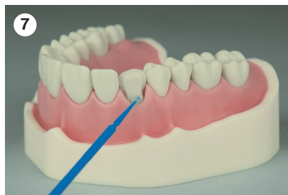
7 Application of an adhesive system, e.g. Harvard InterLock ONE